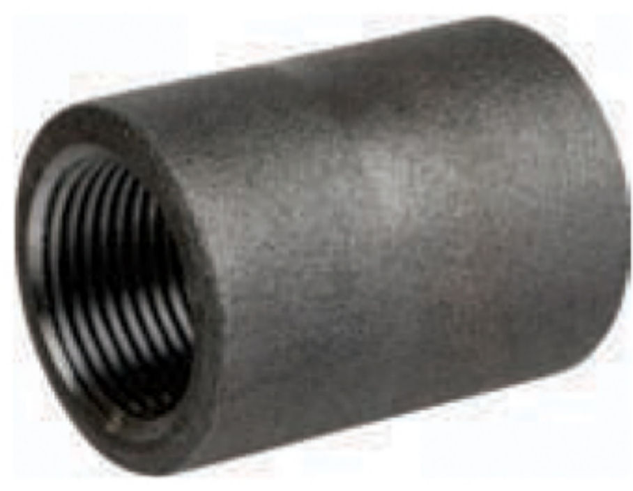
Fig. 42CP3 – Coupling